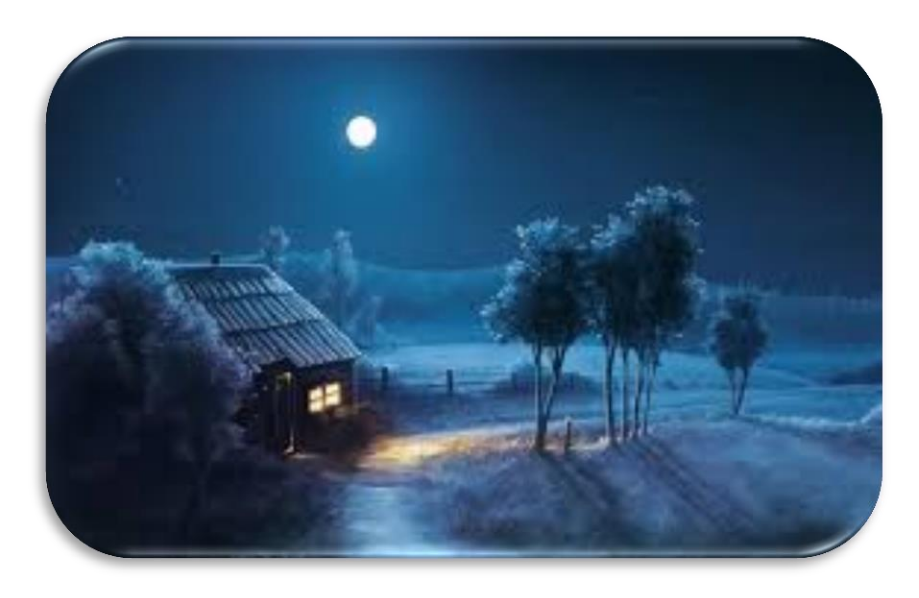
* Not to be confused with vs 2 "darkness" <H2822 choshek>.

<layil> is the only term in Gen 1:5 that belongs to the Night Season.